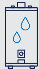
STORAGE TANK WATER HEATER